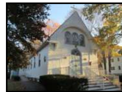
ST. JOSEPH CHURCH 142 LINCOLN RD LINCOLN, MA