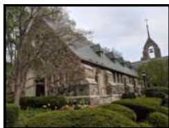
ST. JULIA CHURCH 374 BOSTON POST RD WESTON, MA