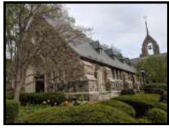
ST. JULIA CHURCH 374 BOSTON POST RD WESTON, MA