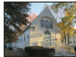
ST. JOSEPH CHURCH 142 LINCOLN RD LINCOLN, MA