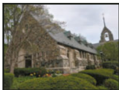
ST. JULIA CHURCH 374 BOSTON POST RD WESTON, MA