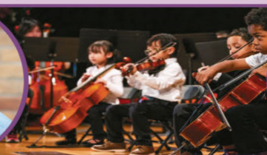
Concert by City Strings United Performing Ensemble