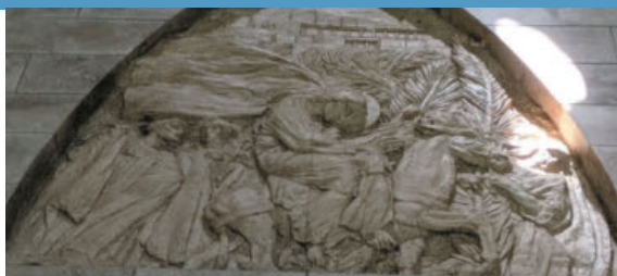
Bas-relief depiction of a humble Jesus on Palm Sunday, on Palm Sunday Road, Israel