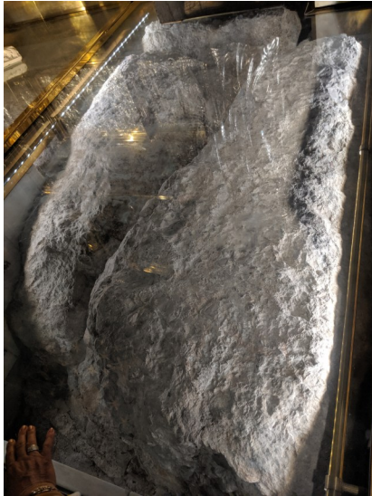
Rock of Calvary