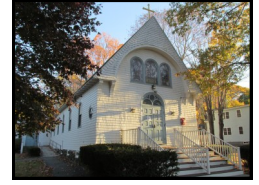
ST. JOSEPH CHURCH 142 LINCOLN RD LINCOLN, MA