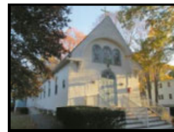
ST. JOSEPH CHURCH 142 LINCOLN RD LINCOLN, MA