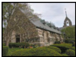
ST. JULIA CHURCH 374 BOSTON POST RD WESTON, MA