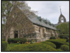
ST. JULIA CHURCH 374 BOSTON POST RD WESTON, MA