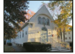
ST. JOSEPH CHURCH 142 LINCOLN RD LINCOLN, MA