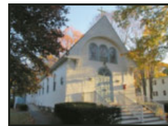
ST. JOSEPH CHURCH 142 LINCOLN RD LINCOLN, MA

Excavated Mikvah outside of the Temple, Jerusalem