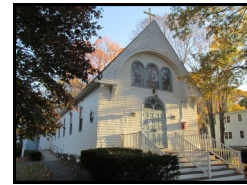
ST. JOSEPH CHURCH 142 LINCOLN RD LINCOLN, MA