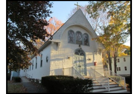
ST. JOSEPH CHURCH 142 LINCOLN RD LINCOLN, MA