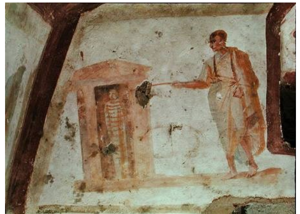
Earliest known depiction of the Raising of Lazarus, 3rd Century, Catacombs, Rome

Now many of the Jews who had come to Mary and seen what he had done began to believe in him.]