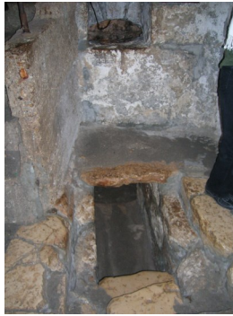
Tomb of Lazarus, Bethany, Israel