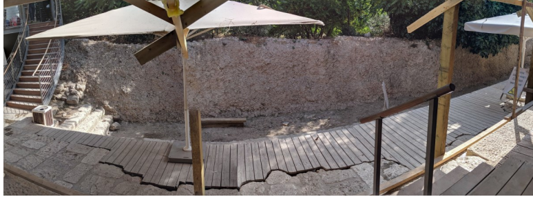
Excavation of the Pool of Siloam, Jerusalem