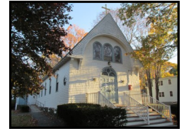
ST. JOSEPH CHURCH 142 LINCOLN RD LINCOLN, MA