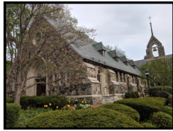
ST. JULIA CHURCH 374 BOSTON POST RD WESTON, MA