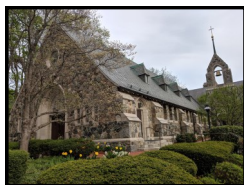
ST. JULIA CHURCH 374 BOSTON POST RD WESTON, MA