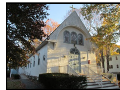
ST. JOSEPH CHURCH 142 LINCOLN RD LINCOLN, MA