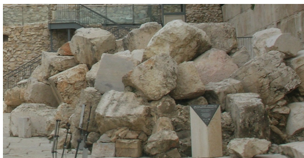
Pile of rocks from destruction of Temple in 68 CE