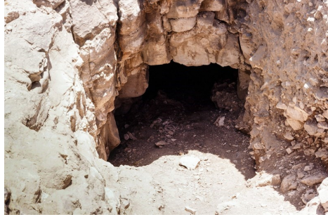
Ancient Cistern in Holy Land