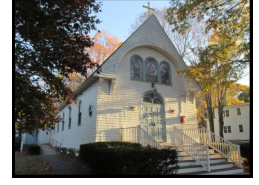
ST. JOSEPH CHURCH 142 LINCOLN RD LINCOLN, MA

"This is My commandment, that you love one another, just as I have loved you. John 15:12