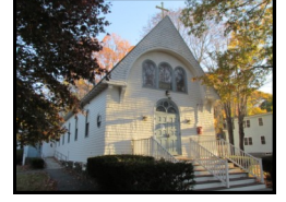
ST. JOSEPH CHURCH 142 LINCOLN ROAD LINCOLN, MA

Season of Creation: September 1—October 4, 2021