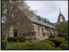
ST. JULIA CHURCH 374 BOSTON POST ROAD WESTON, MA