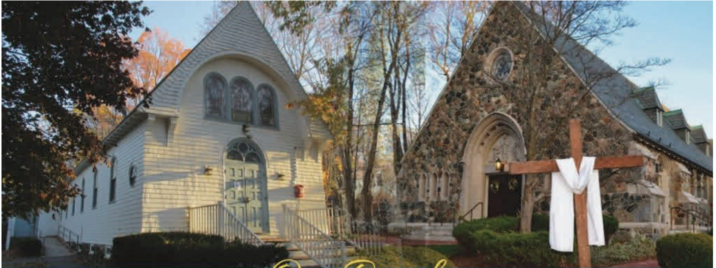
ST. JOSEPH CHURCH