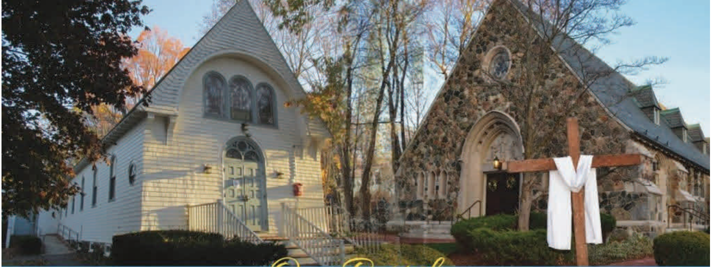
ST. JOSEPH CHURCH