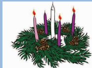
Third Sunday of Advent

That there are only nine more days left to Advent? Here are some ways to spend the rest of your “waiting” time: