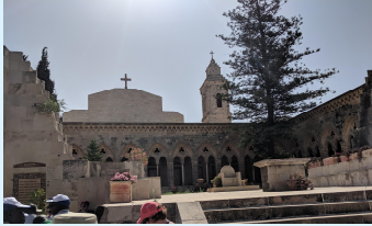
The Church of Pater Noster (Our Father)

Did you know...that Lord's Prayer that Jesus taught the Apostles is the same one we pray at Sunday Mass?