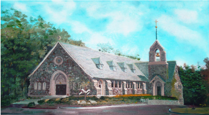
ST. JULIA CHURCH 374 BOSTON POST ROAD WESTON, MA

Telephone: 781-899-2611 Fax: 781-899-8046 Website: www.stjulia.org