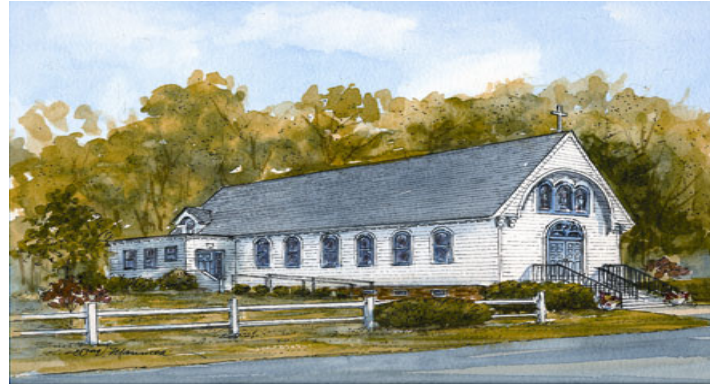
ST. JOSEPH CHURCH 142 LINCOLN ROAD LINCOLN, MA