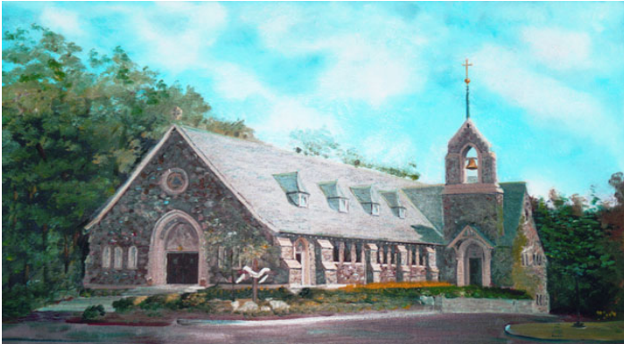
ST. JULIA CHURCH 374 BOSTON POST ROAD WESTON, MA

Telephone: 781-899-2611 Fax: 781-899-8046 Website: www.stjulia.org