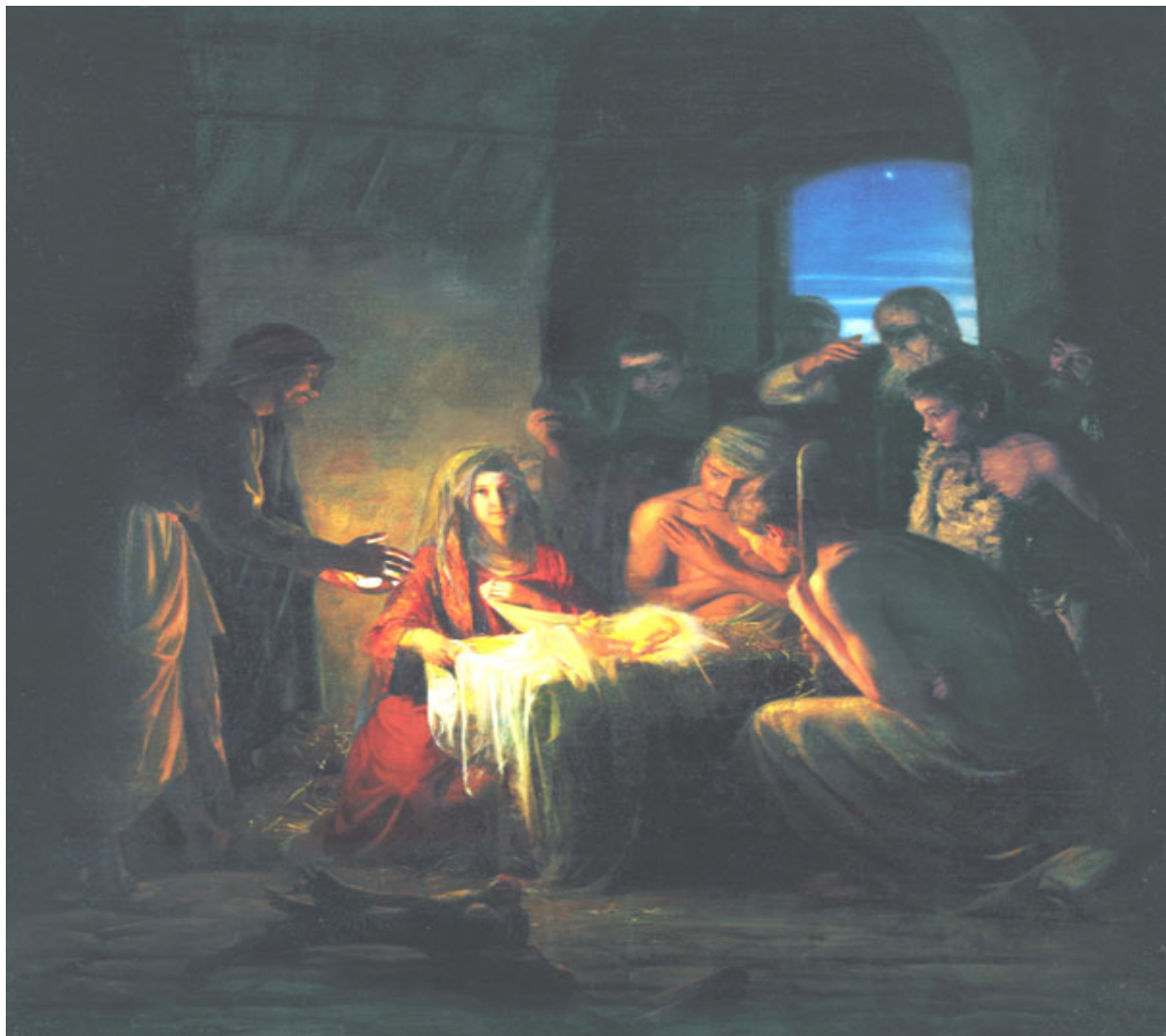
The Birth of Jesus by Carl Heinrich

Director of Youth Formation and Ministry (Gr. 6-12)